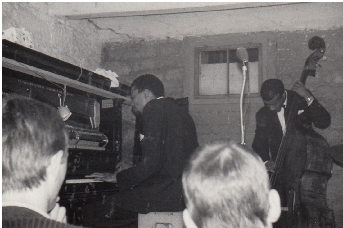
The Dollar Brand Trio, St. Gallen 1962